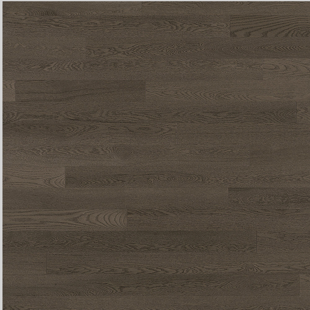
HARDWOOD - HALLWAY