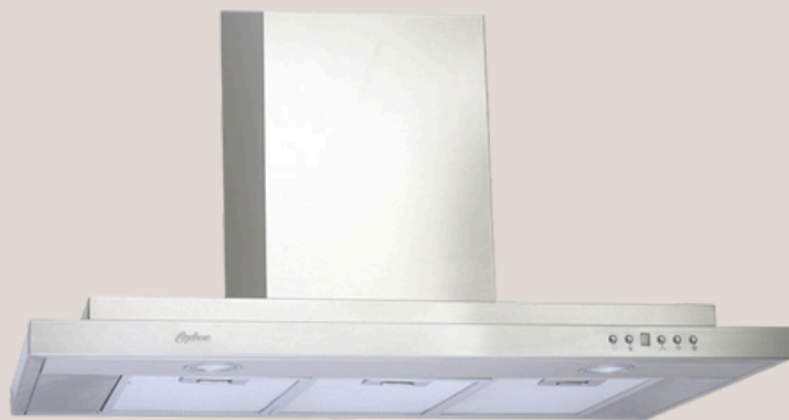
UPGRADED HOOD FAN