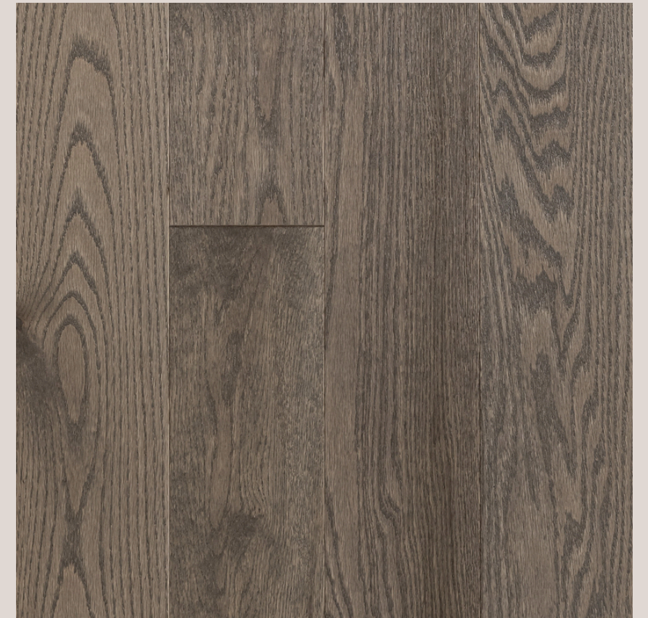
UPGRADED RED OAK ENGINEERED FLOORING